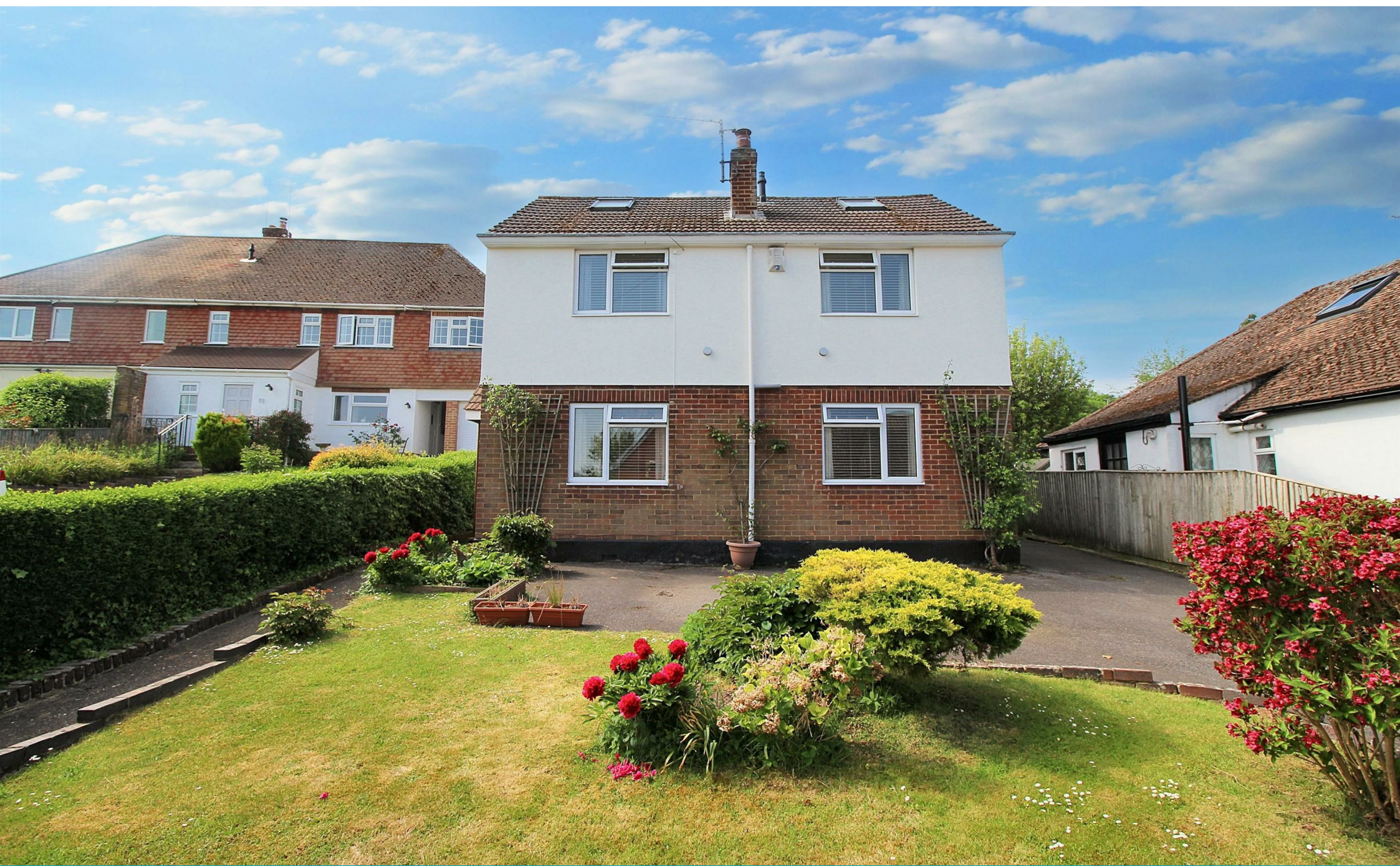
Adam House, 13 Glebe Road, Purley On Thames, Reading, RG8 8DP Guide Price £550,000 Freehold