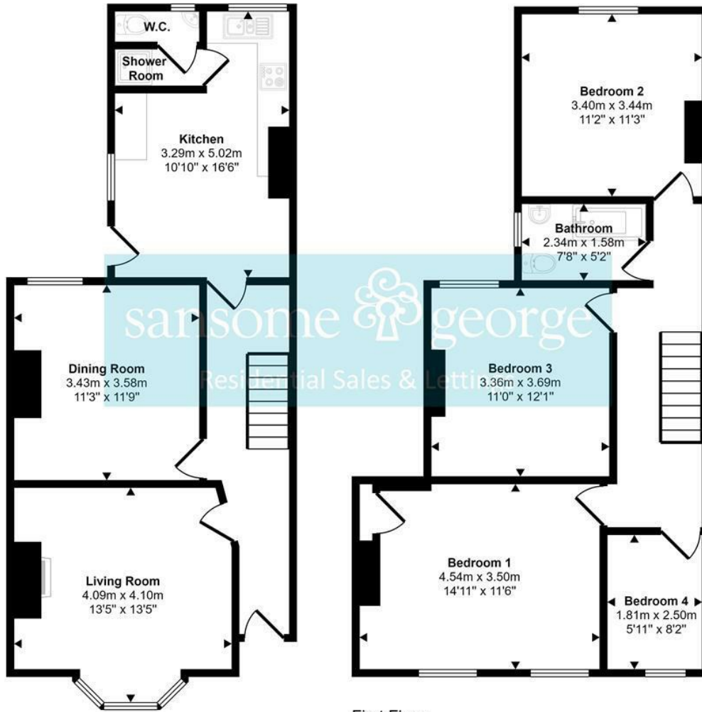
Ground Floor Approx 56 sq m / 604 sq ft

Approx Gross Internal Area 116 sq m / 1246 sq ft