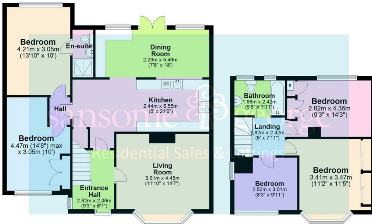
Ground Floor Approx. 84.0 sq. metres (904.4 sq. feet)