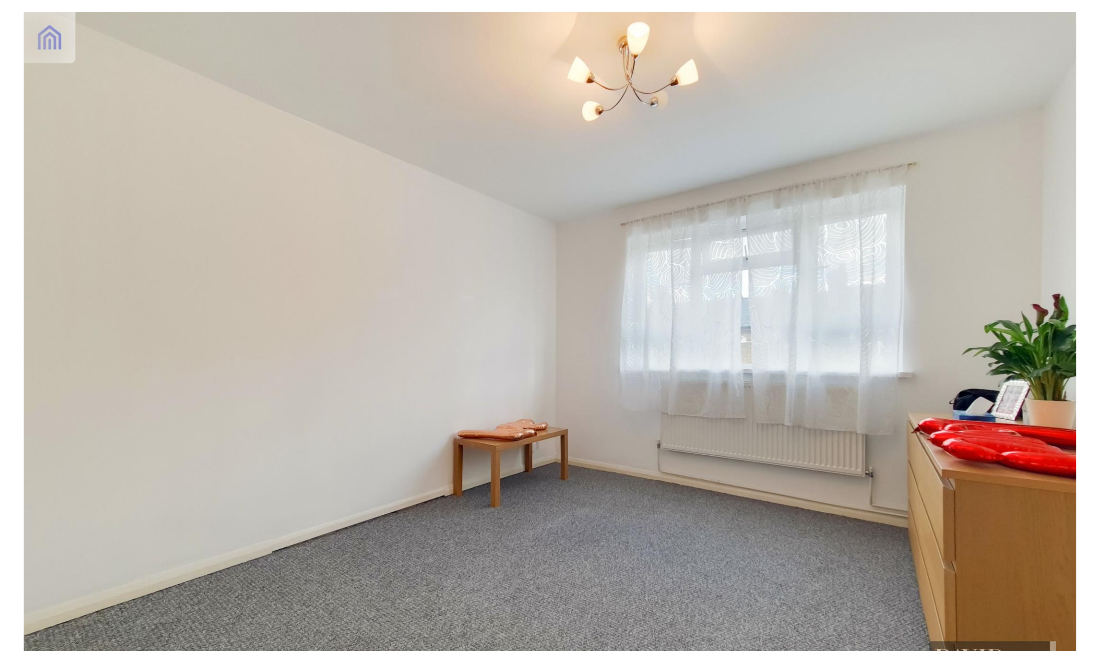
Trinder Road, N19 4QT