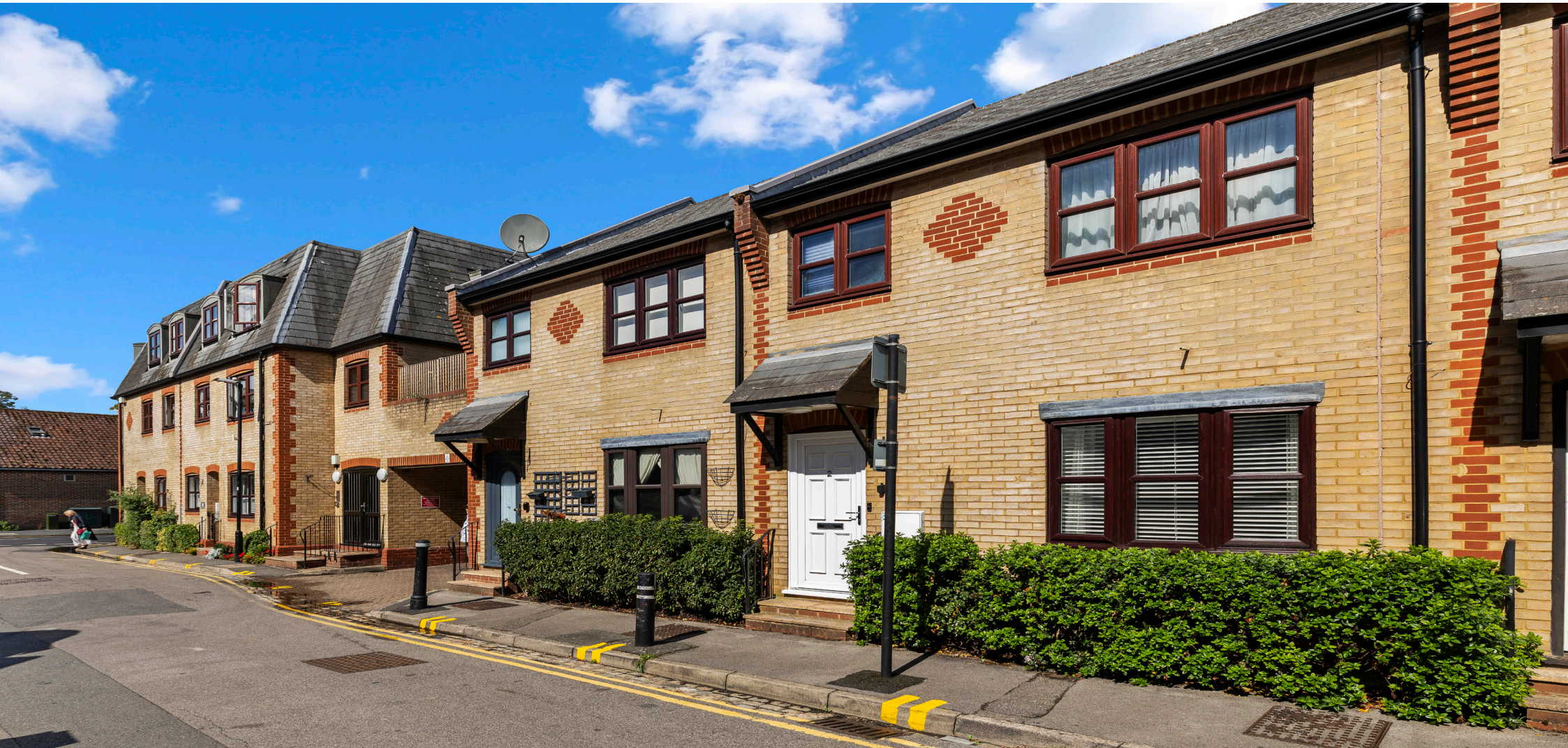
Castleview House, Windsor