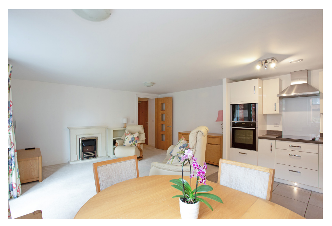
Living Area Holly Place, High Street, Cobham, Surrey, KT11 3EB

Approximate Floor Area = 81.6 sq m / 878 sq ft