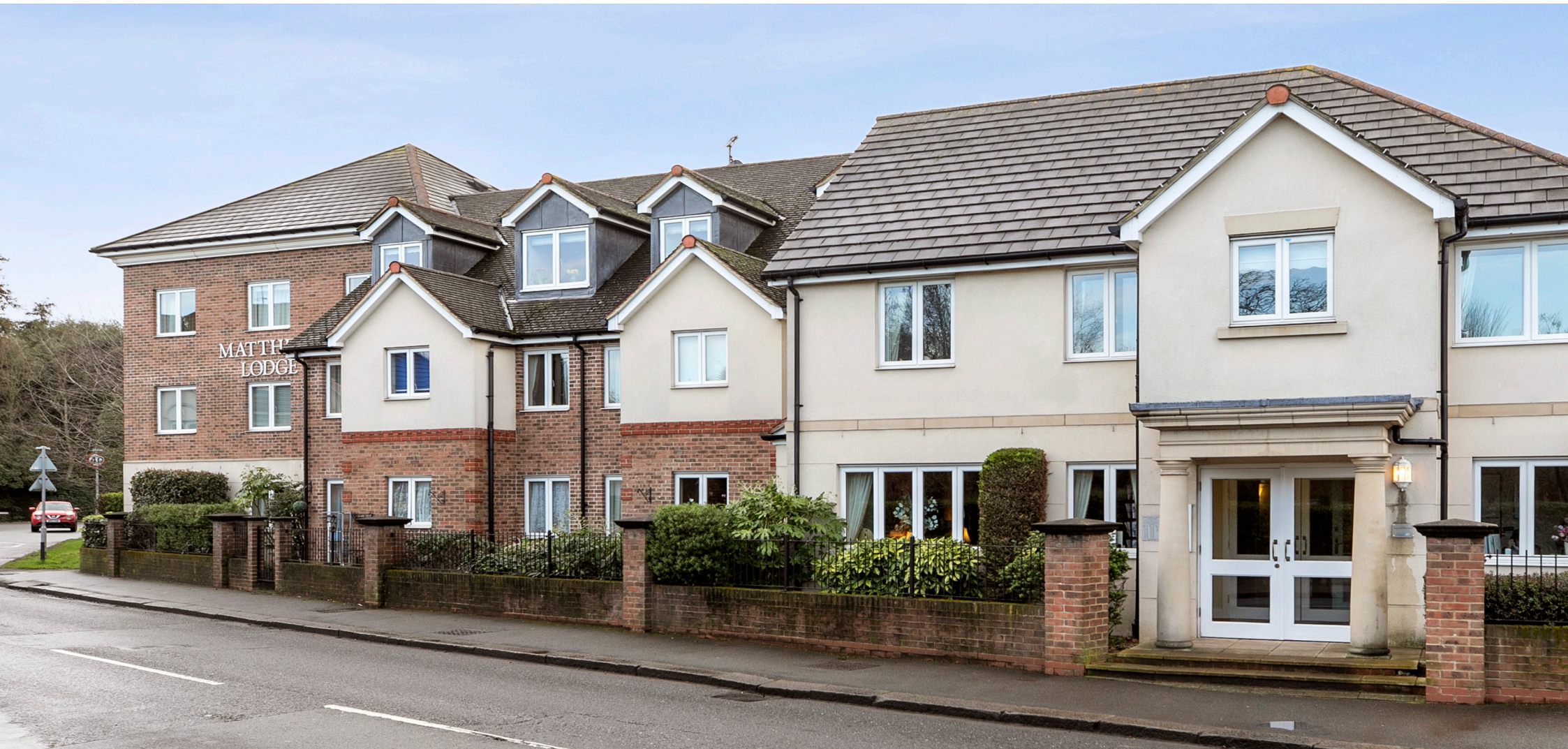
Matthews Lodge, Addlestone