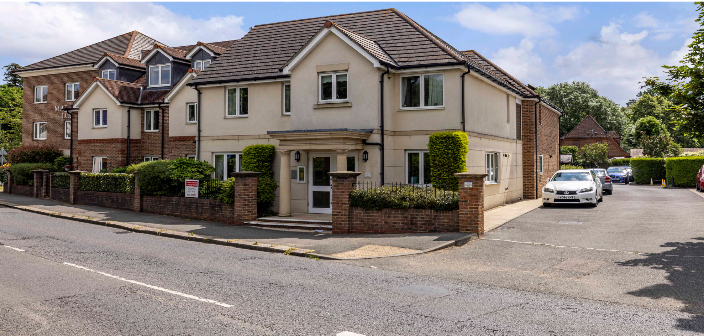
Matthews Lodge, Addlestone