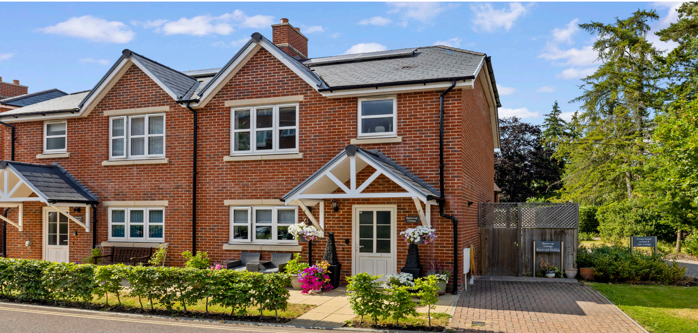
Buttercup Cottage, Ascot