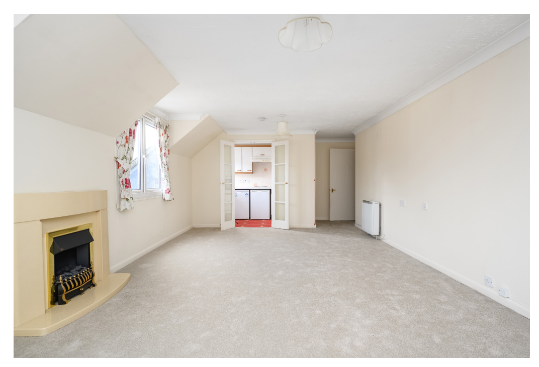
Living Area Lords Bridge Court, Mervyn Road, Shepperton, Surrey, TW17