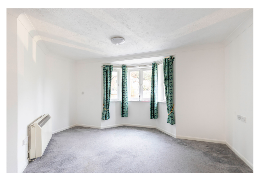
Living Area Redwood Court, Epsom Road, Epsom, Surrey