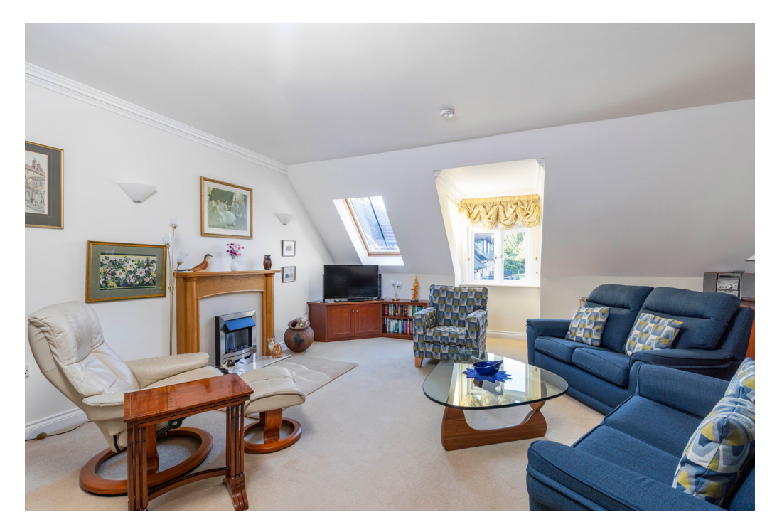
Living Area Bramley Grange, Horsham Road, Guildford, Surrey, GU5 OES