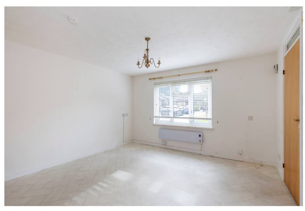
Living Area Village Gardens, West Street, Epsom, Surrey