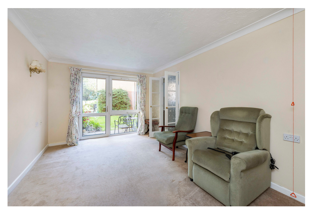
Living Area Badgers Court, The Grove Epsom, Surrey, KT17 4JW