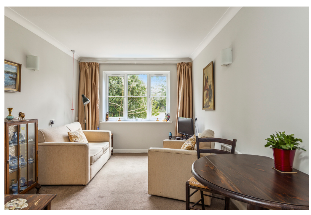
Living Area Alexandra Lodge, Monument Hill, Weybridge, Surrey, KT13 8RY