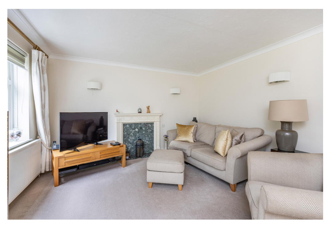
Living Area Fairlawn, Hall Place Drive, Weybridge, Surrey