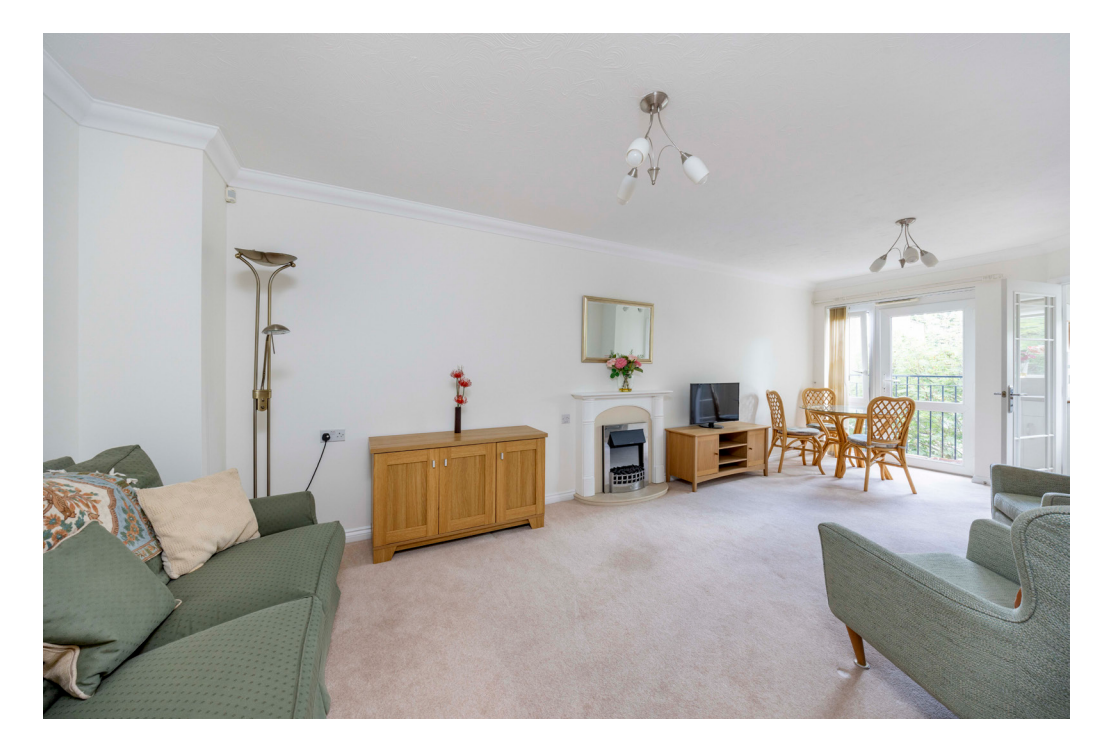
Living Area Ballard Lodge, 11 Laleham Road, Shepperton, Surrey