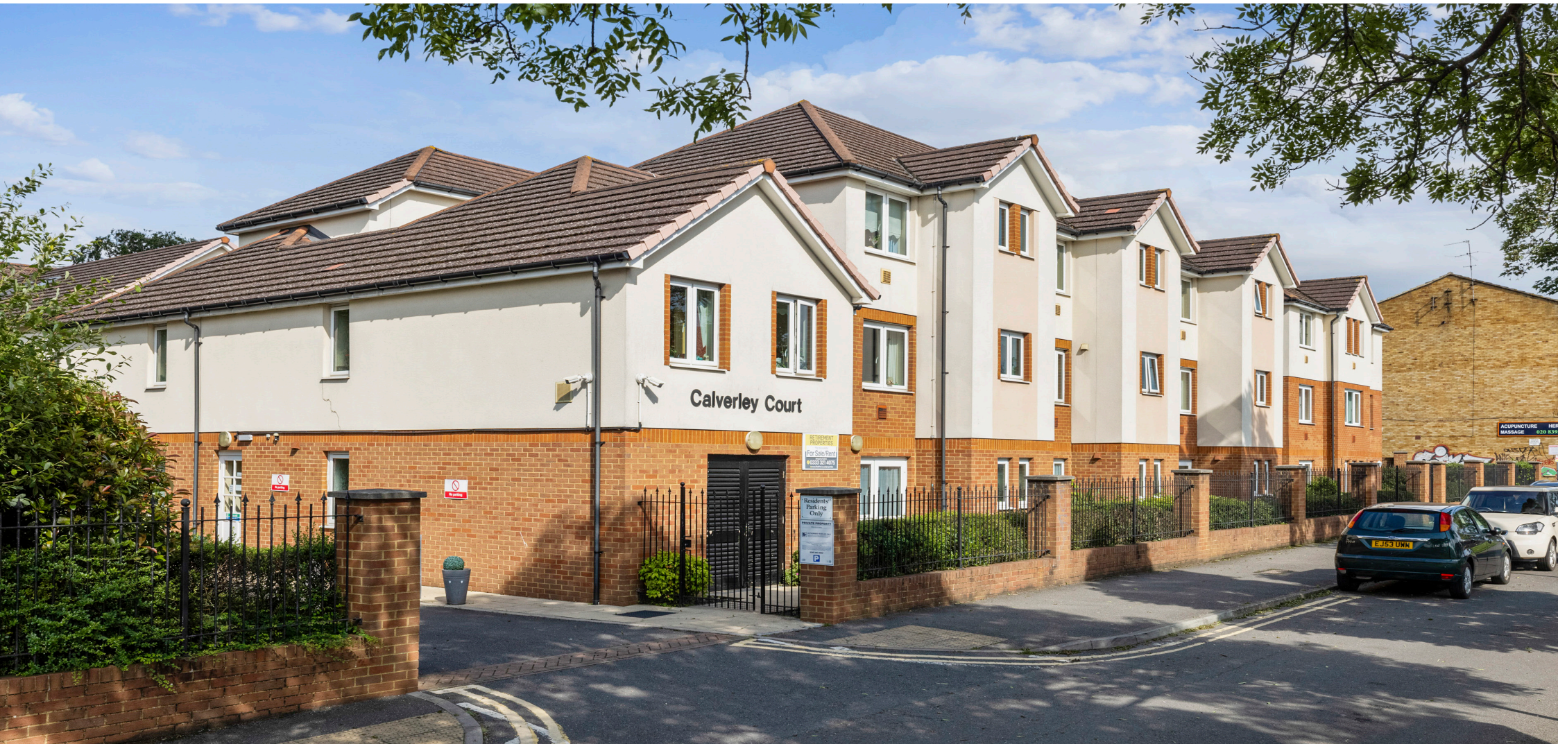
Calverley Court, Epsom