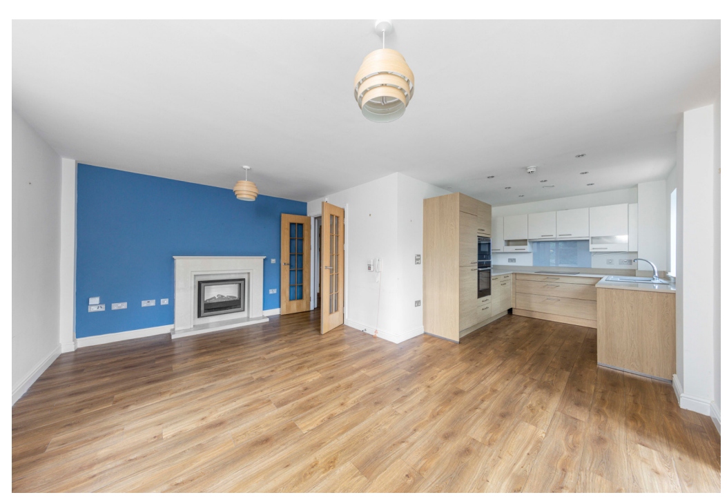
Living Area Austin Place, Oatlands Drive, Weybridge, Surrey