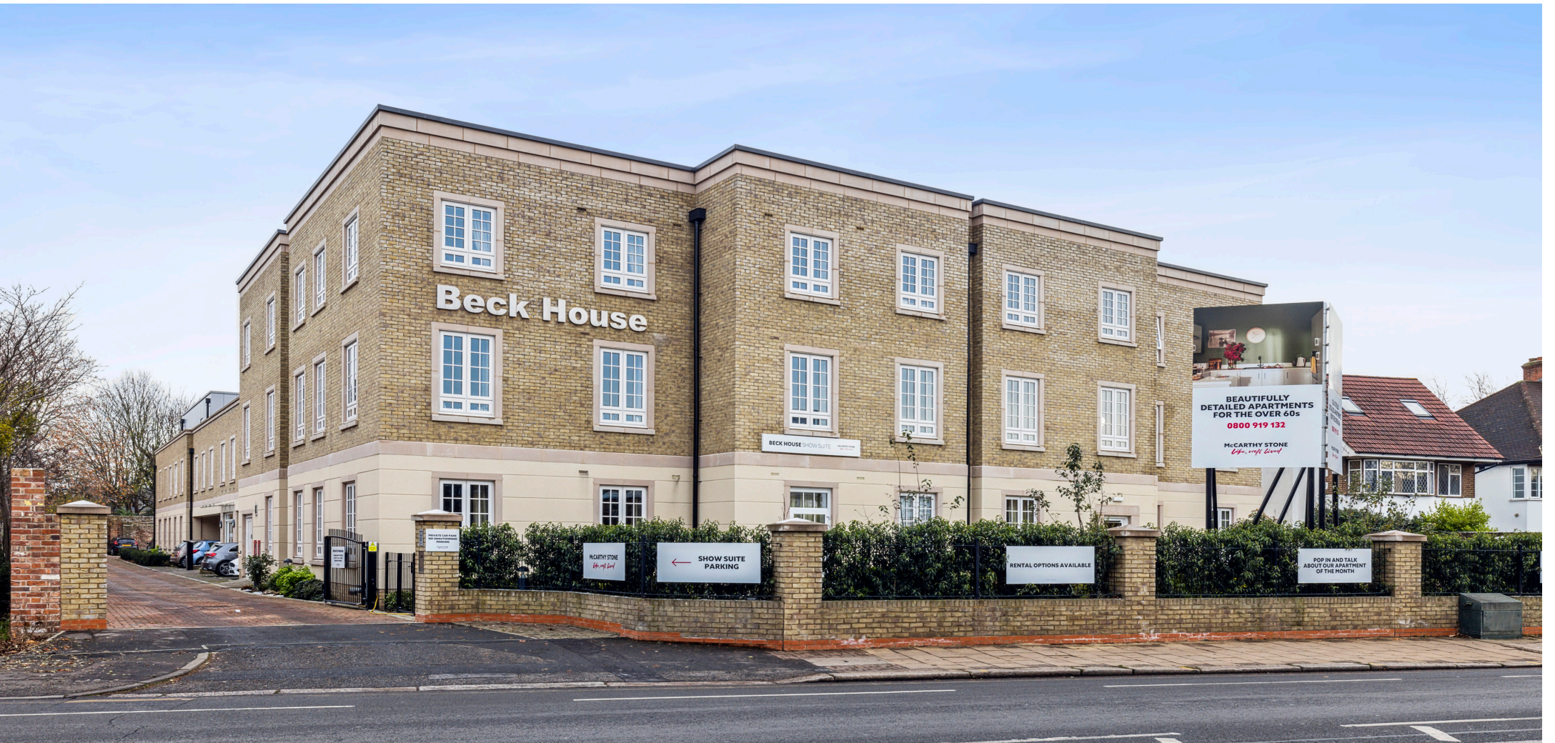
Beck House, Isleworth