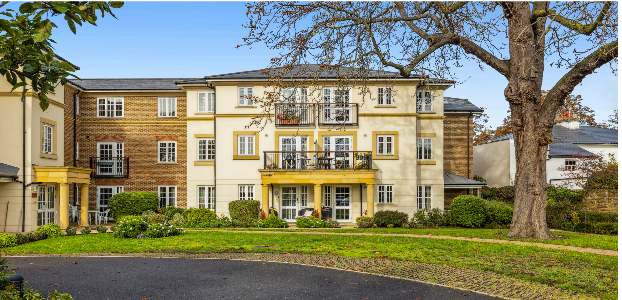
Gifford Lodge, Twickenham