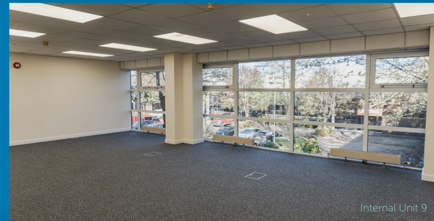
Internal Unit 9