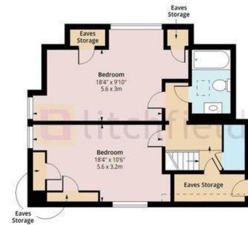
Second Floor Floor Area 541 Sq Ft - 50.26 Sq M

All measurements and areas are approximate only. Dimensions are not to scale. This plan is for guidance only and must not be relied upon as a statement of fact.