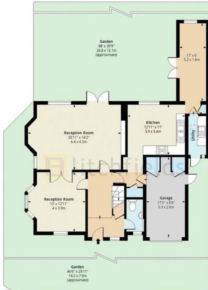
Ground Floor Floor Area 962 Sq Ft - 89.37 Sq M