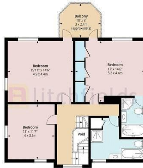
First Floor Floor Area 948 Sq Ft - 88.07 Sq M