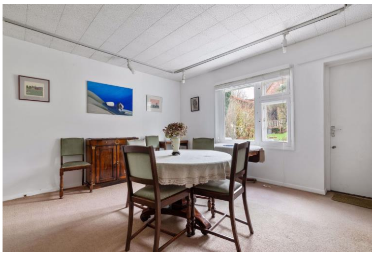
Addison Way, Hampstead Garden Suburb, NW11 Freehold £999,995