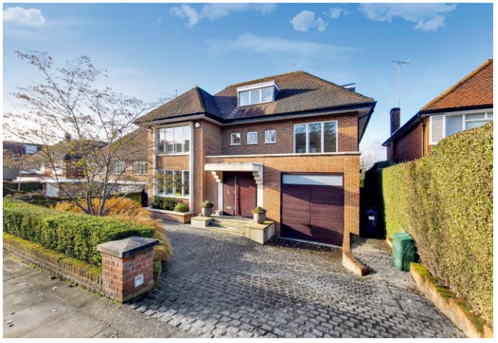
Church Mount, Hampstead Garden Suburb, N2 Freehold £5,395,000