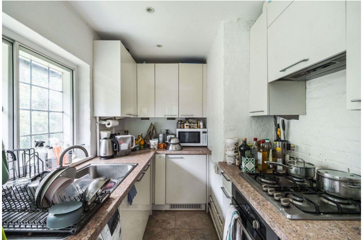
Waterlow Court, Hampstead Garden Suburb, NW11 Share of Freehold £650,000