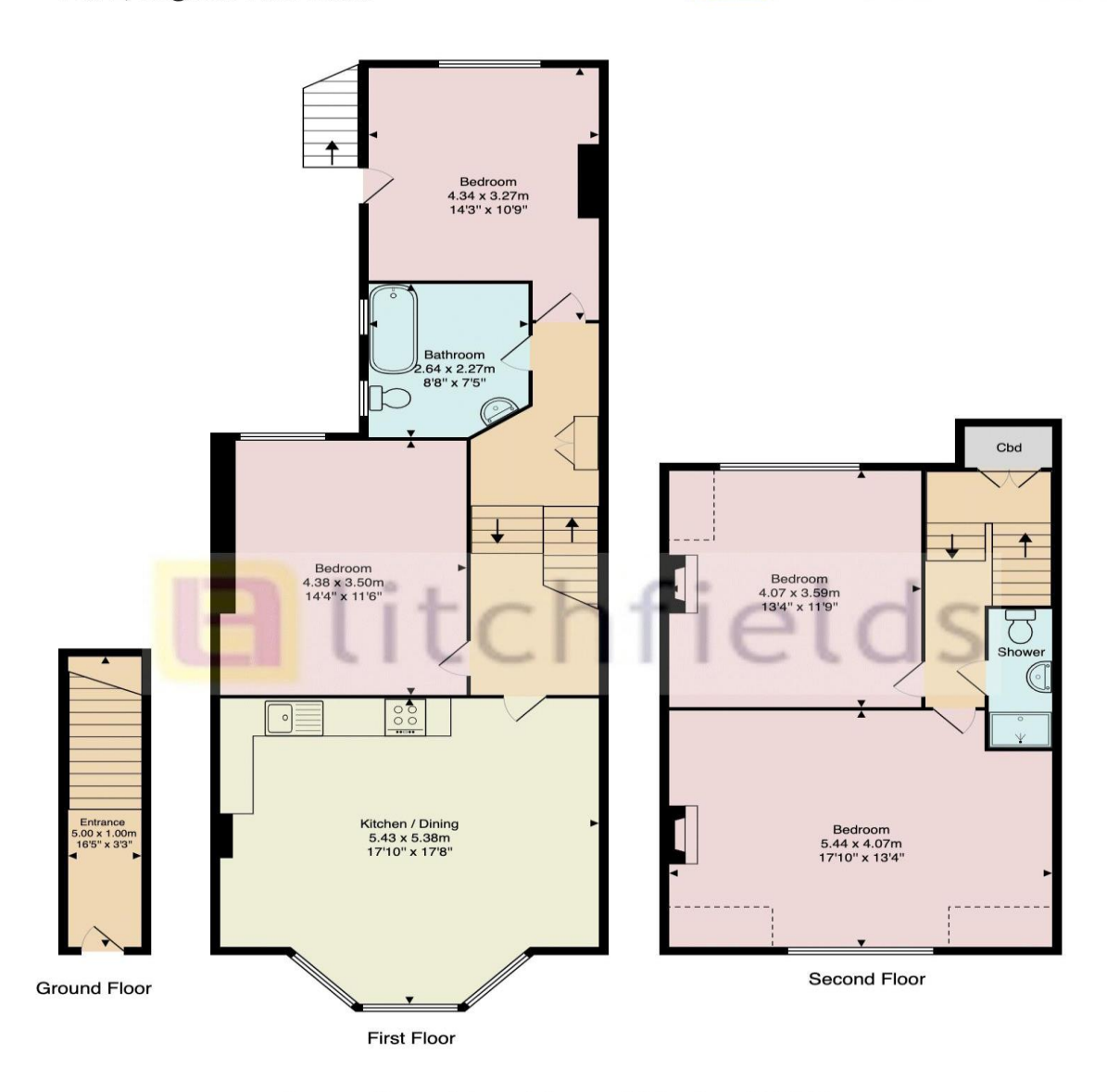
Flat 2, Regents Park Road

Approx. Gross Internal Area: 121.0 m² ... 1302 ft²