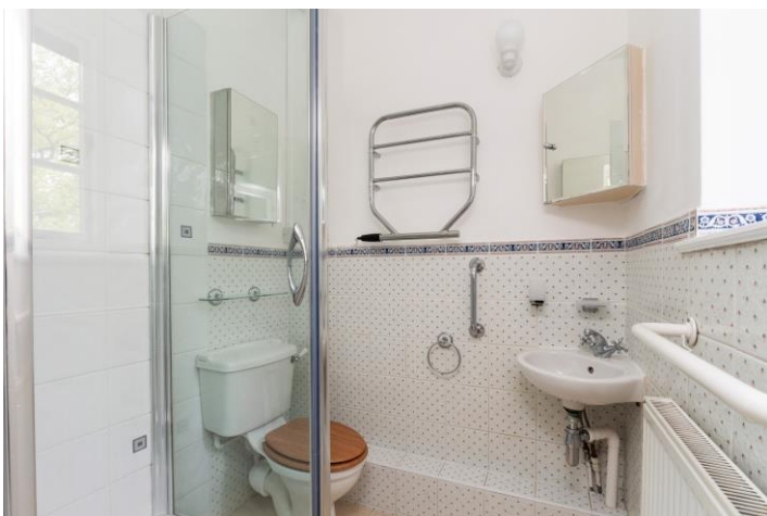
En-suite to Master Bedroom