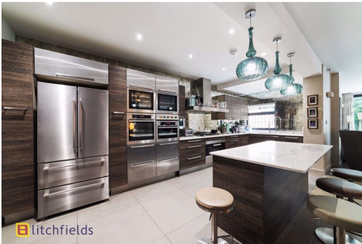
Rowan Walk, Hampstead Garden Suburb, N2 Freehold £3,200,000