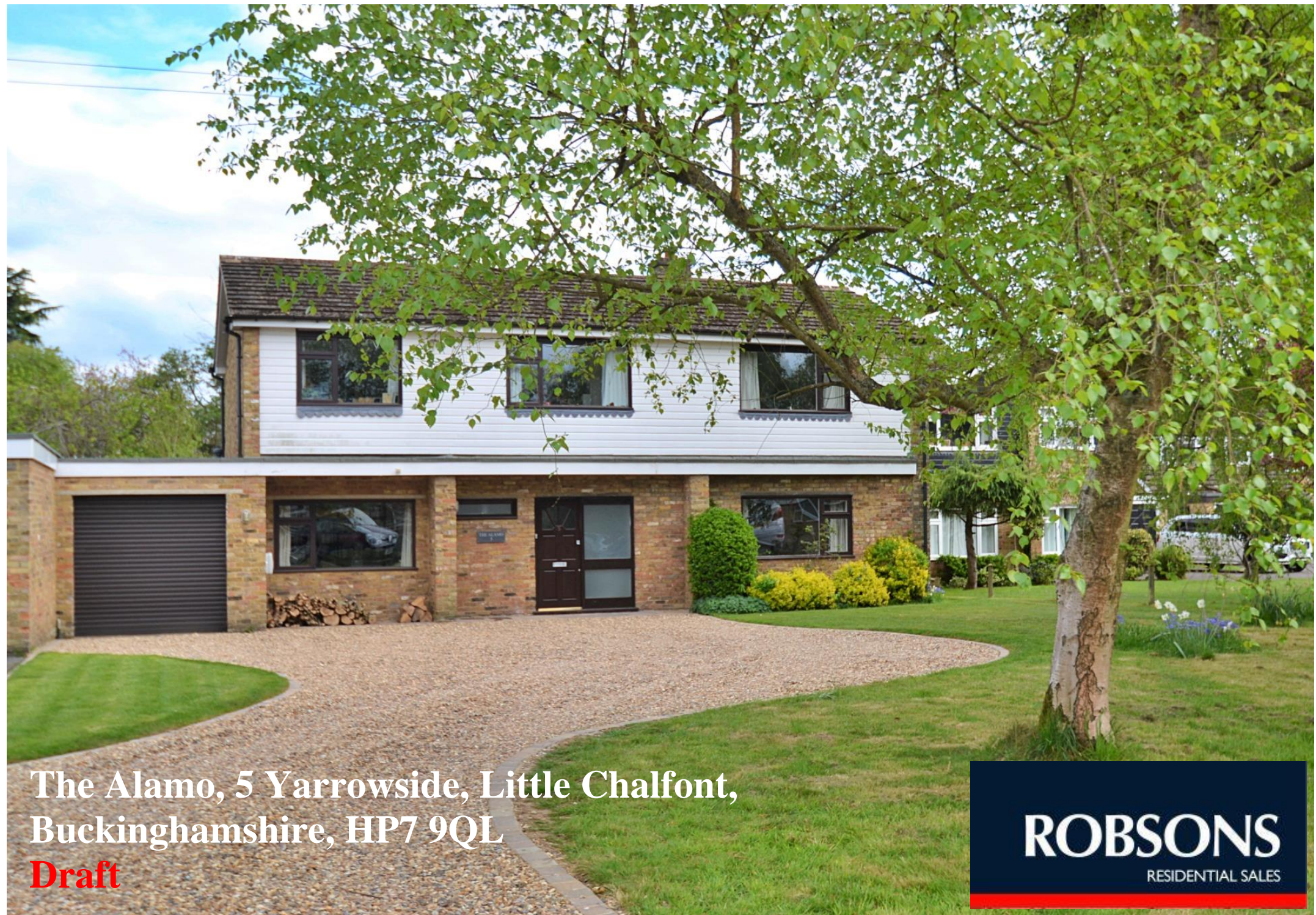
The Alamo, 5 Yarrowside, Little Chalfont, Buckinghamshire, HP7 9QL Draft