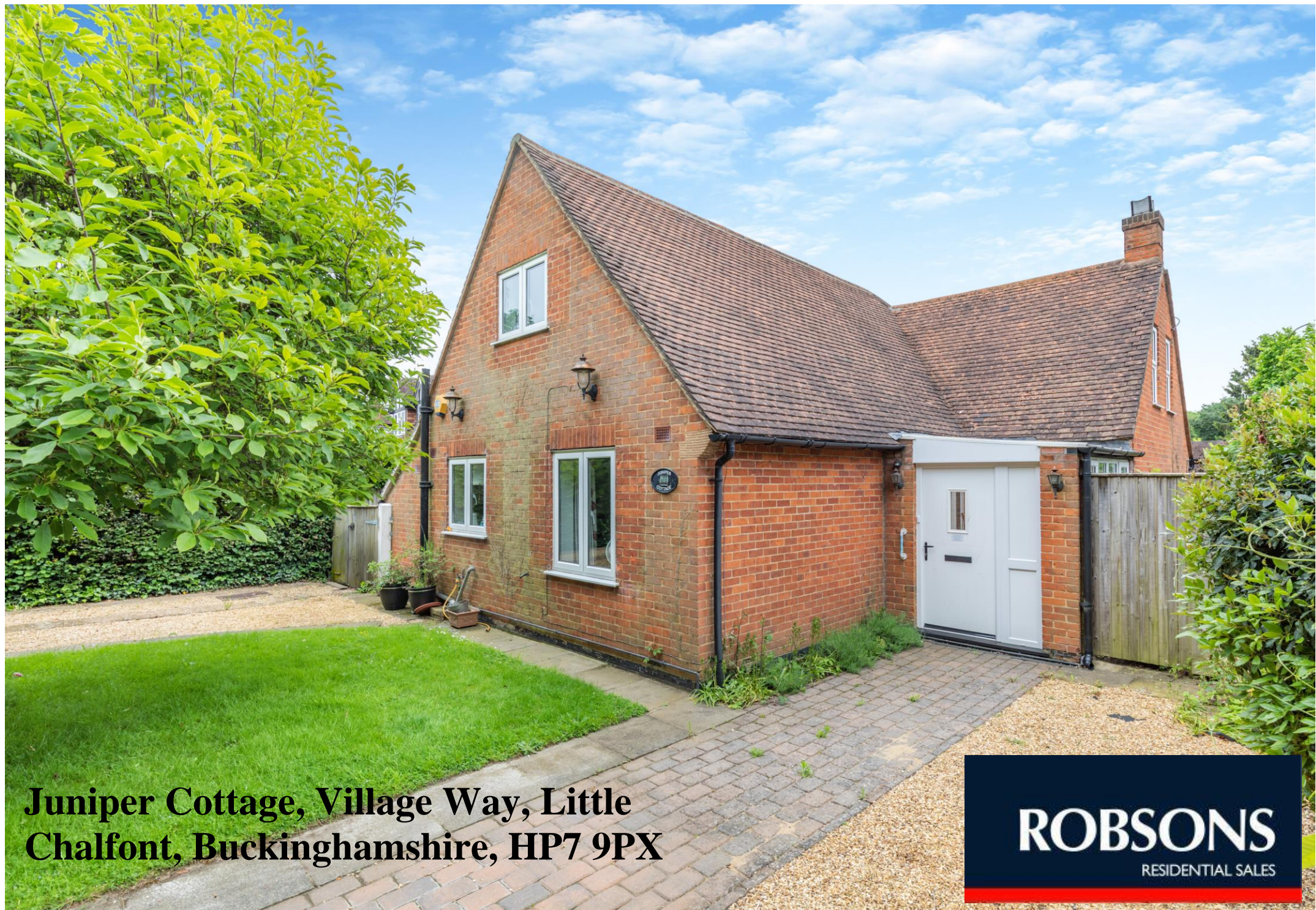
Juniper Cottage, Village Way, Little Chalfont, Buckinghamshire, HP7 9PX