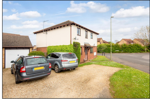
Garage & Parking to Front