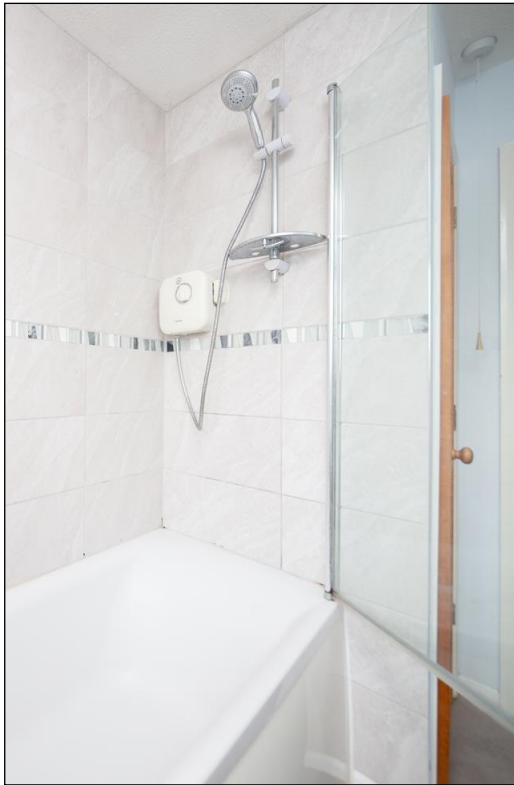
Shower over the bath