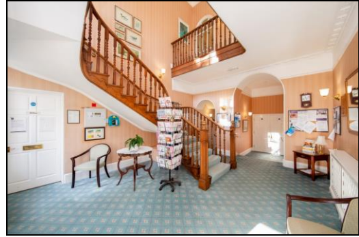
Main Entrance Hall