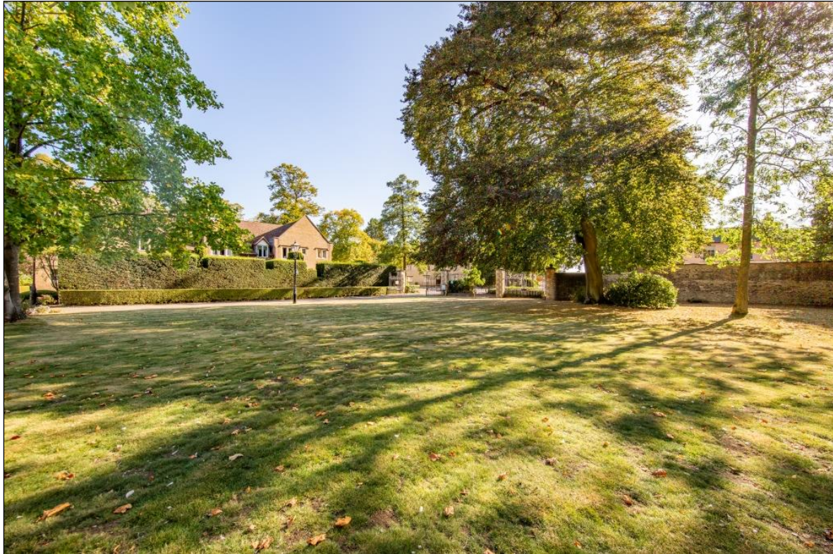
Main Entrance & Front Lawns