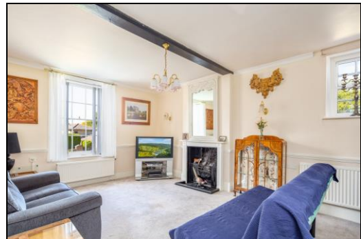
Apartment Sitting Room