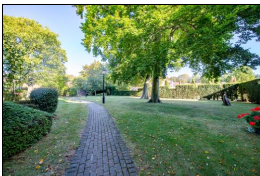
Communal Grounds to the Rear