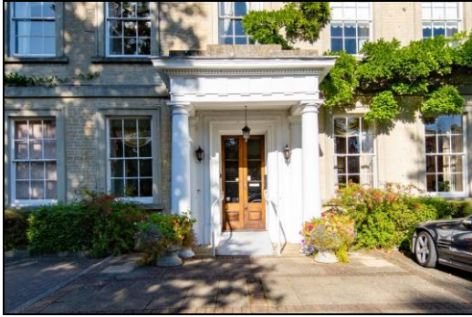
Main Entrance Porch