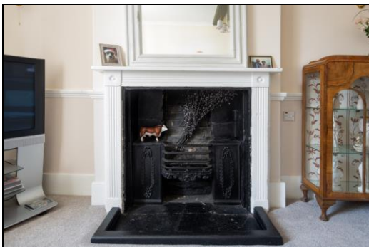
Sitting Room Fireplace