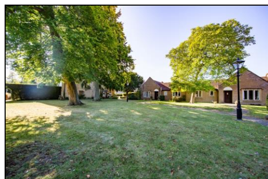
Communal Grounds to the Rear