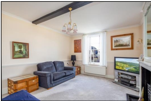
Apartment Sitting Room