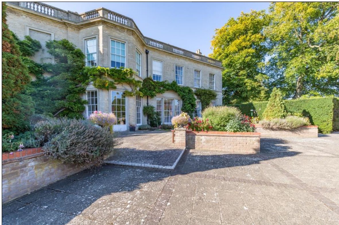
Communal Sun Terrace