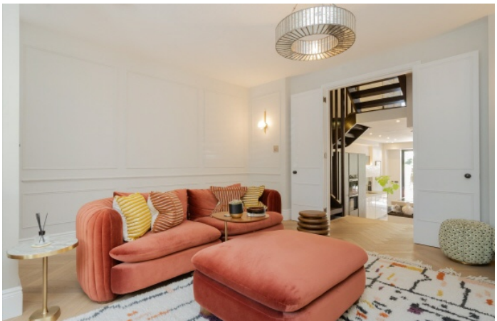
Rainville Road, W6