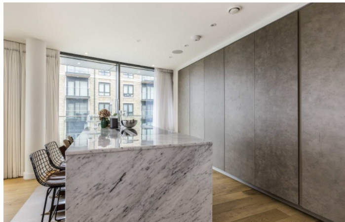
Parr's Way, W6