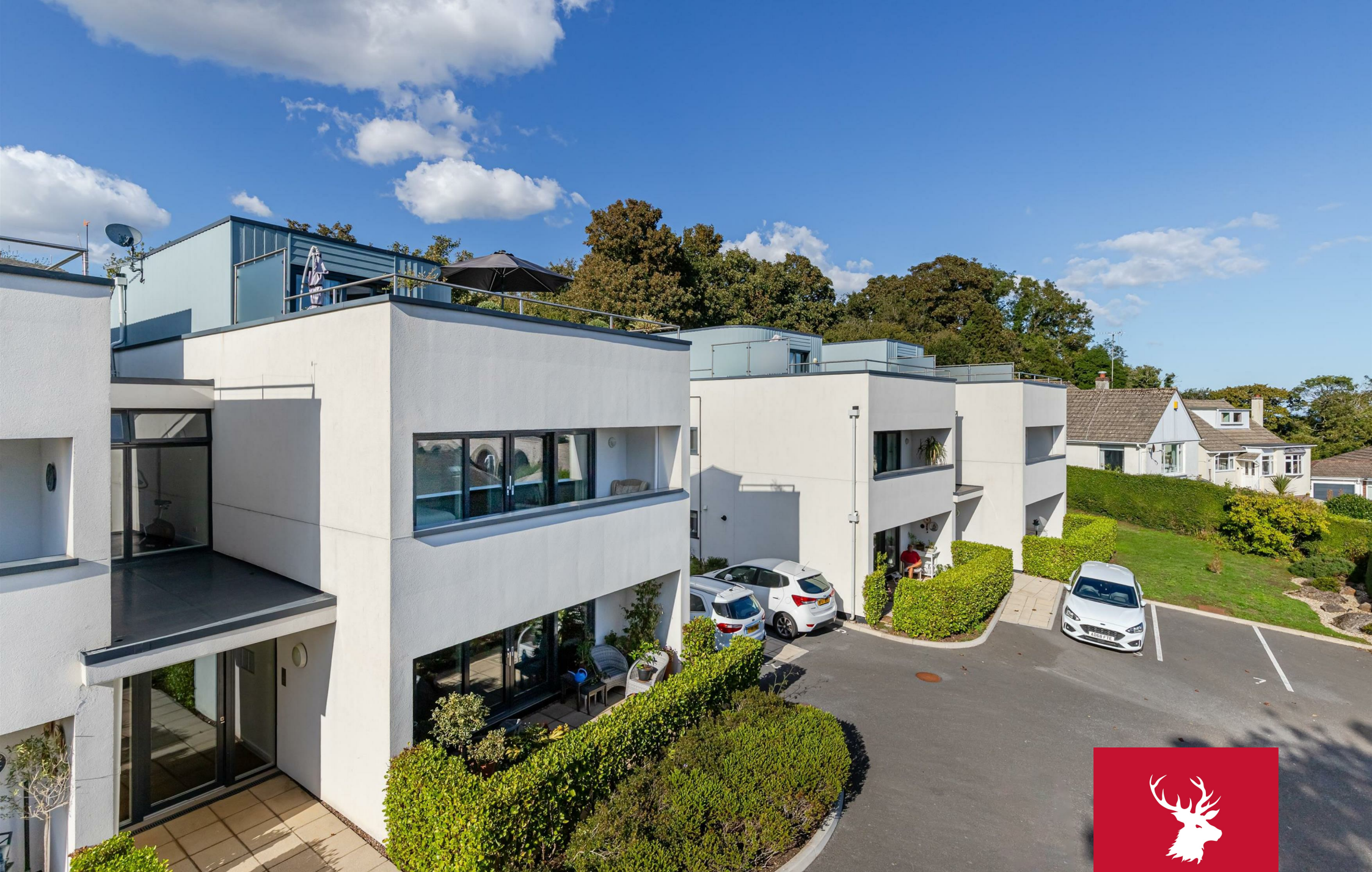
Apartment 4, Broadsands