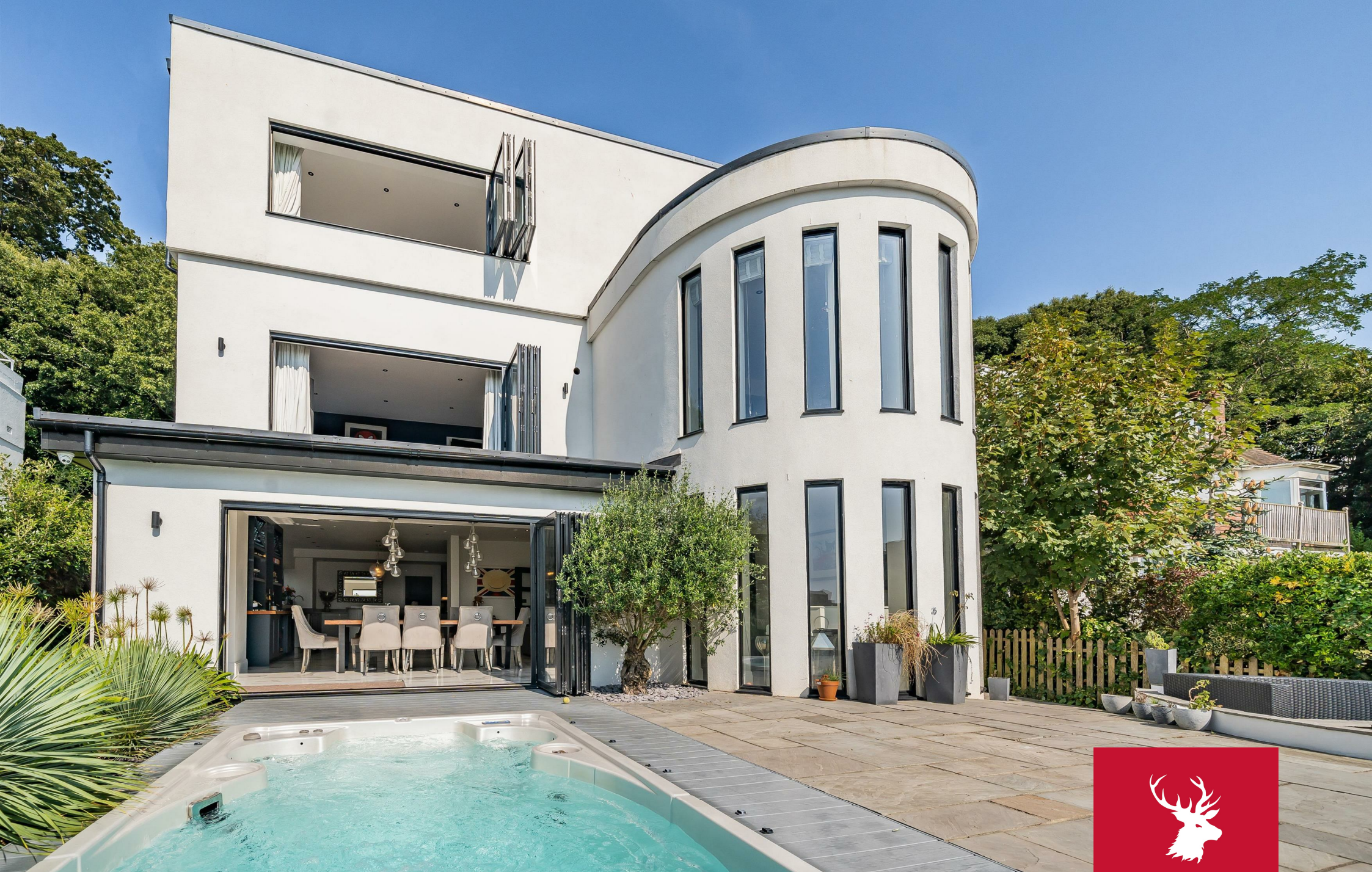
Blue Hayes, Park Hill Road