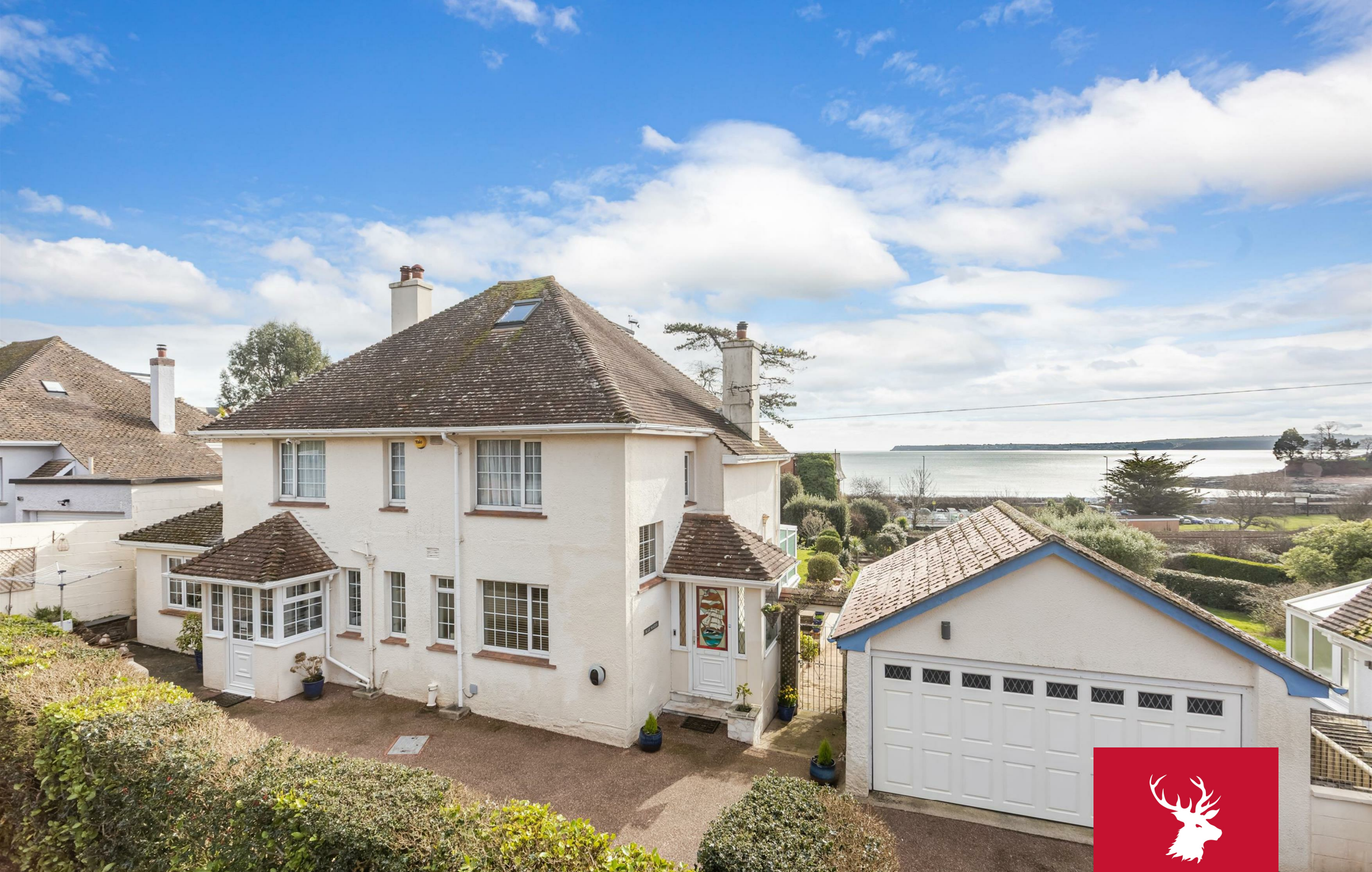
Blue Waters, Hennapyn Road