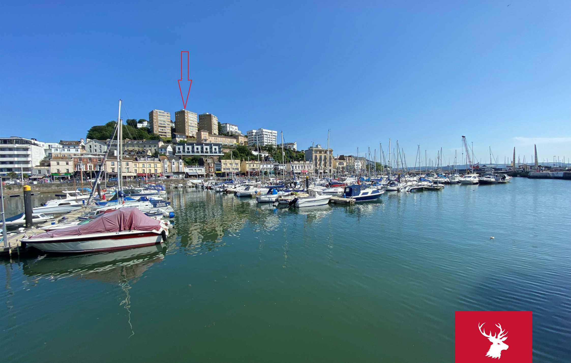
B3, Shirley Towers