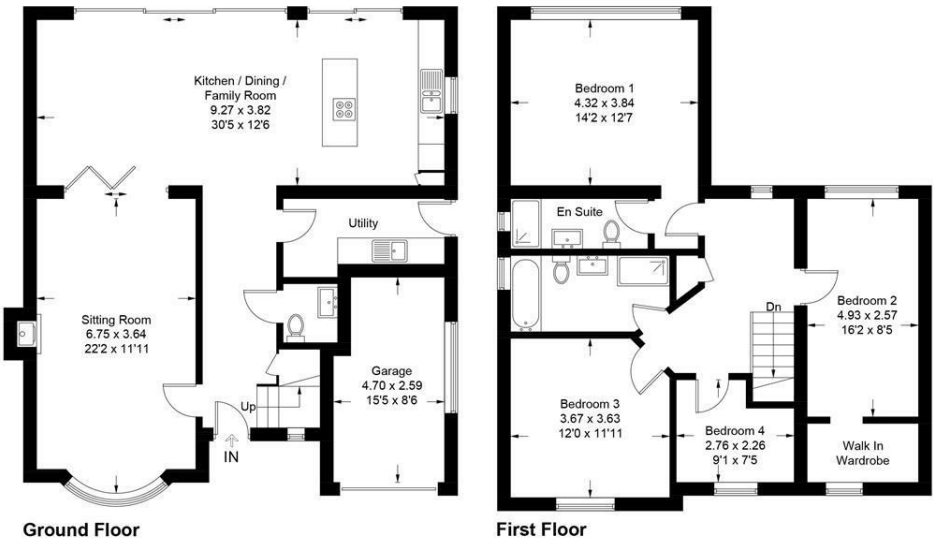
Illustration for identification purposes only, measurements are approximate, not to scale. Fourlabs.co © (ID1129582)