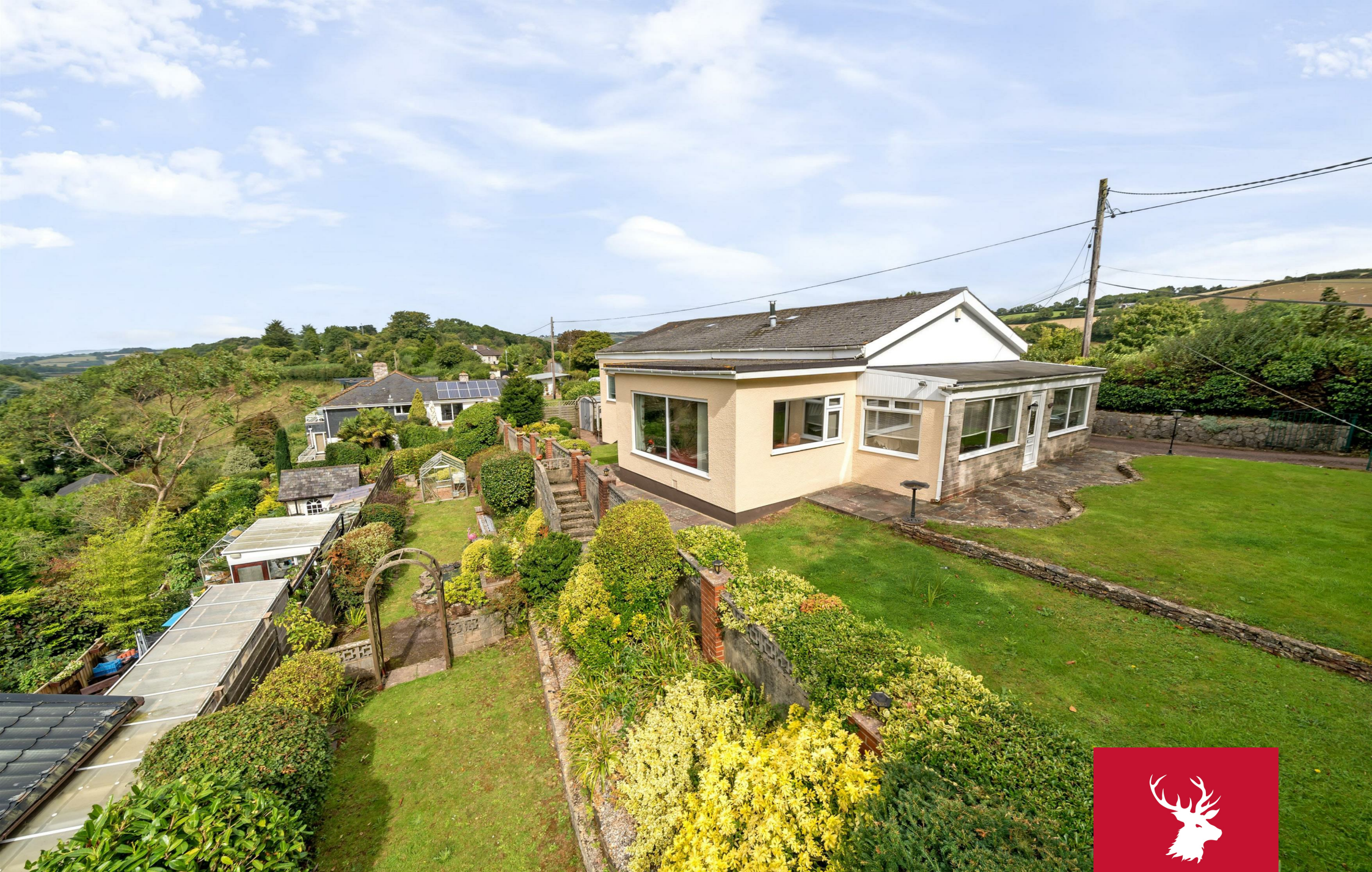
Santa Rosa, Ivy Tree Hill