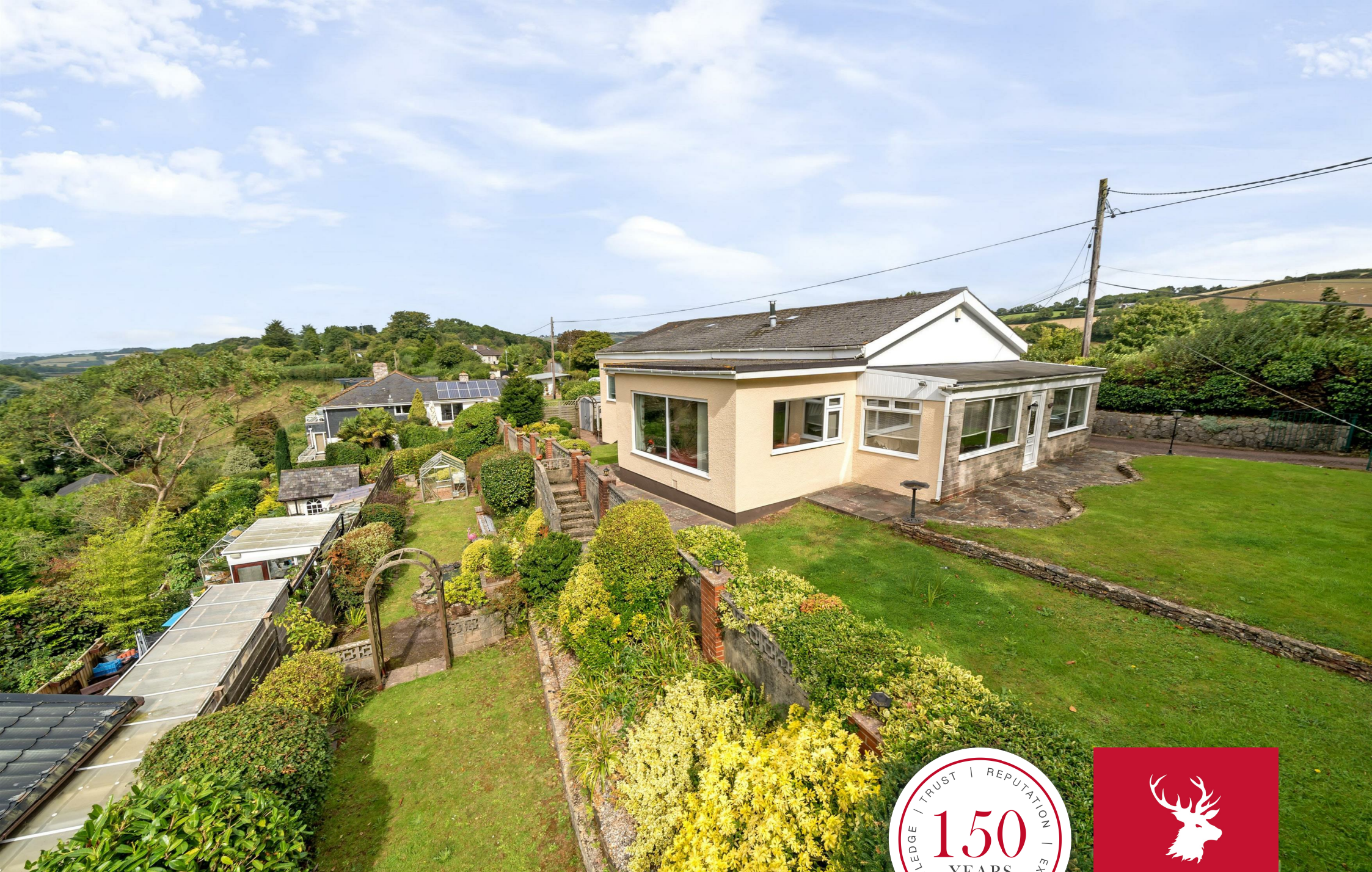
Santa Rosa, Ivy Tree Hill