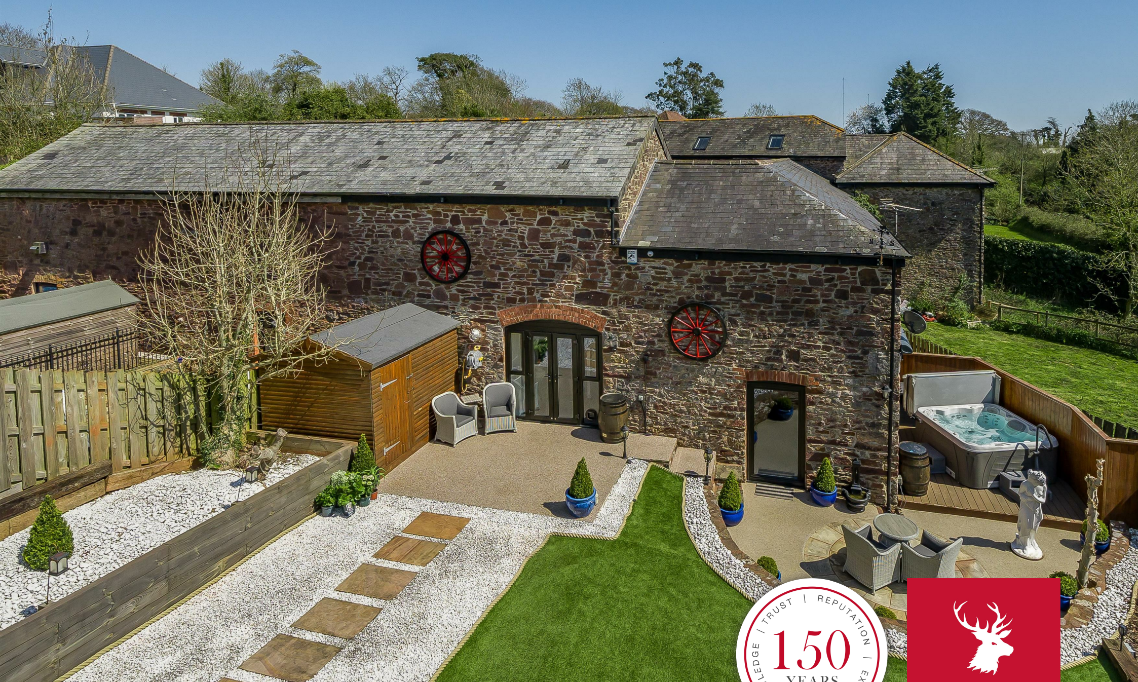
South Orchard House