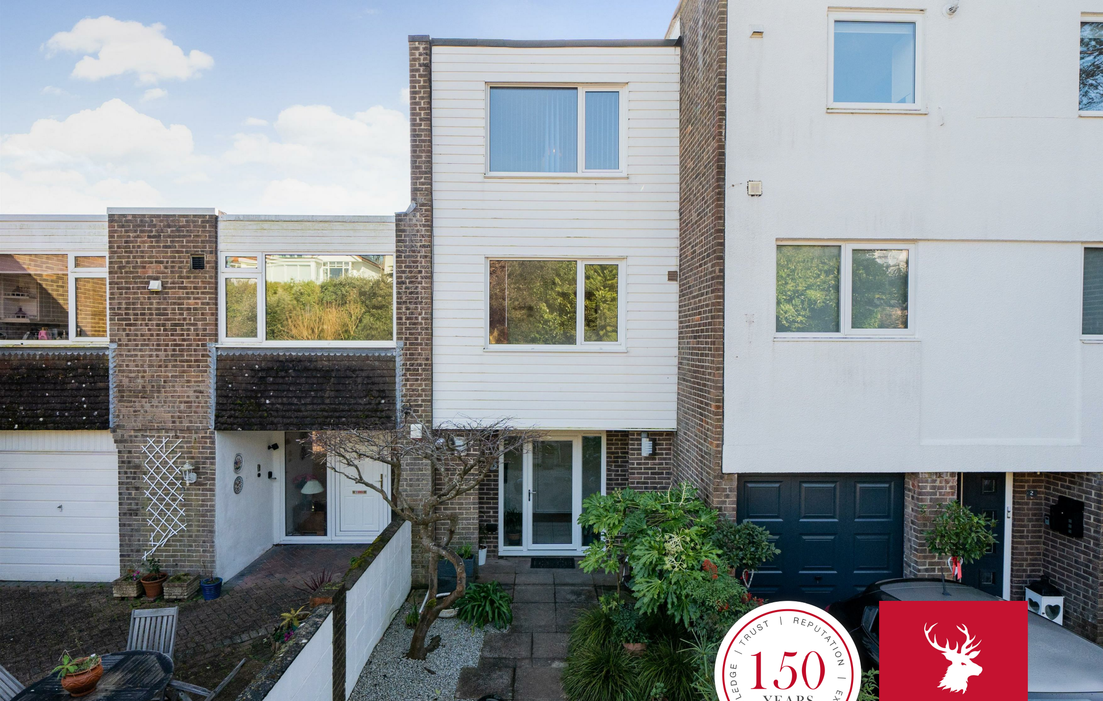
3a, Danby Heights Close