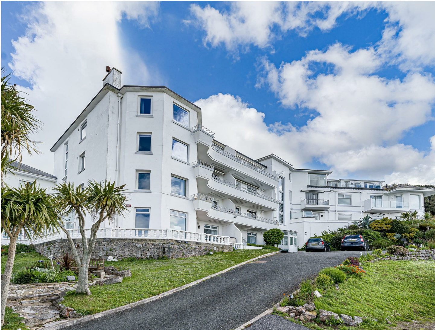
3 Park Hall