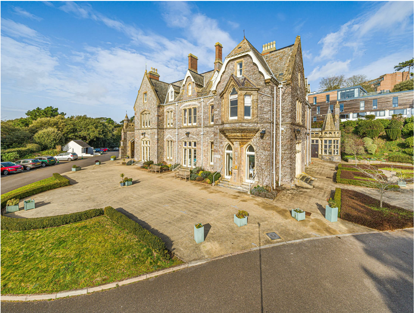
8 Manor House