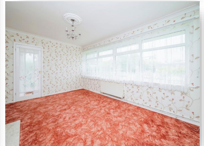
Myrtle Court, Gorleston Great Yarmouth NR31 8EQ