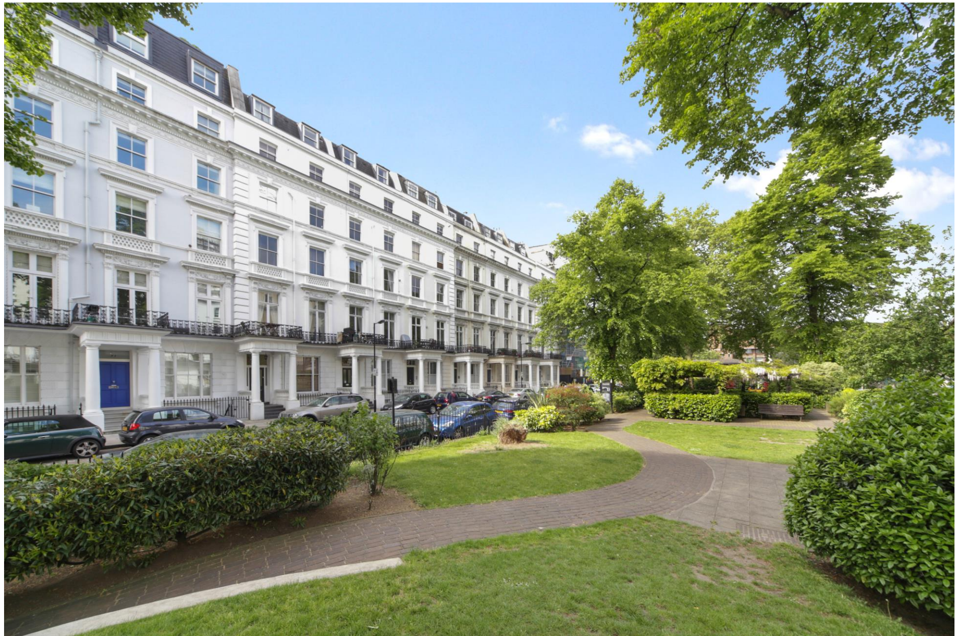
LCP House, Ogle Street, London W1W 6HU sales@lcpprivate.com 020 7723 1733