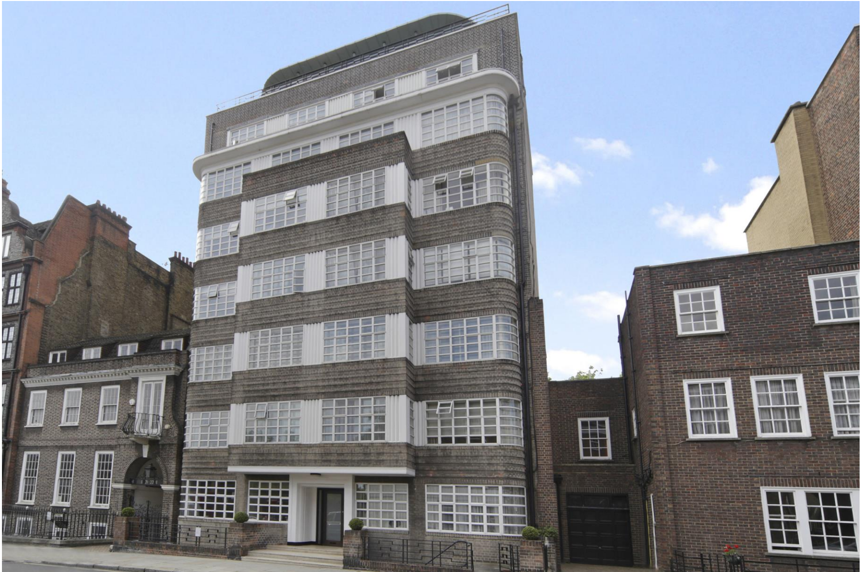
LCP House, Ogle Street, London W1W 6HU sales@lcprivate.com 020 7723 1733