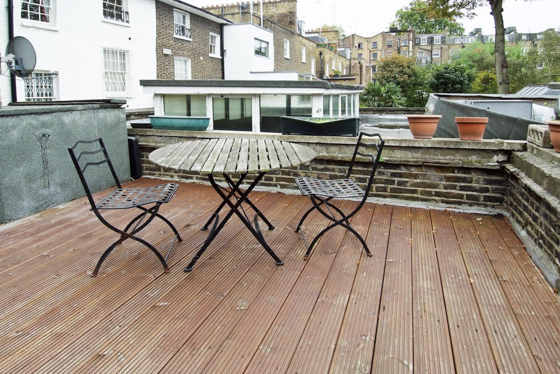
LCP House, Ogle Street, London W1W 6HU sales@lcpprivate.com 020 7723 1733